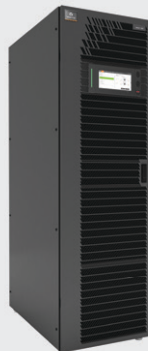
Liebert EXM UPS

The LIEBERT® EXL™ S1 and the LIEBERT EXM™ UPS from Vertiv are recent examples of innovative performance.