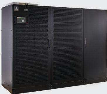
Liebert EXL S1 UPS

Just maybe a streetcar should be named ... Granville!