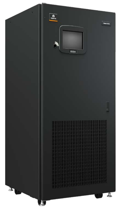
Liebert® STS2 SR 400-600A