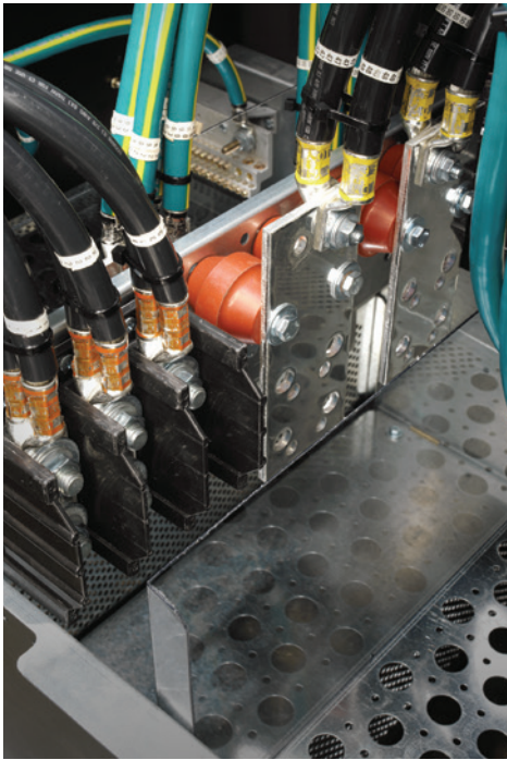
Input power connections with provisions for 2 hole lugs are standard on the Liebert FDC. (208V and 380-415V, 50 Hz model shown)

The Liebert FDC 208V and 380-415V, 50 Hz models use inline 42-pole panelboards with wide-open access channels. The four panelboards are separated into vertical compartments with individual hinged access covers. The Liebert FDC 380-480V, 60 Hz unit uses standard side-by-side 42-pole 400A panelboards, for more capacity at a higher voltage. With one panelboard in the front and one in the rear, there is plenty of space in each compartment for wiring. Hinged access covers allow easy access for service and reconfiguring.