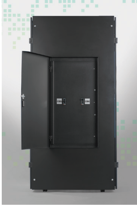
Optional Maintenance Tie-Breakers allow connection to different inputs without shutting down the load.