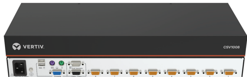
Vertiv CSV 1008

These multi-user KVM switches, available in 8 and 16 port models, provide a straightforward user experience and help conserve space in your server room and reduce cable clutter.