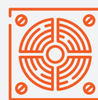
3 Ventilation System Power rating: 1kW per unit