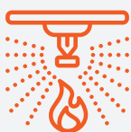
1 Fire Control System Power rating: 10kW

Should any unforeseen situation arises, emergency systems should be activated to ensure the safety of your staff and your equipment, or to allow for minimal or no disruption to business productivity. Vertiv's world-class power protection solutions can support your emergency lighting, communication and fire control systems, as well as control room operations to allow you to have a full view of your floor activity.