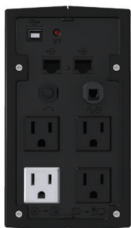
500/650 VA back view

*Battery run time may vary depending on load