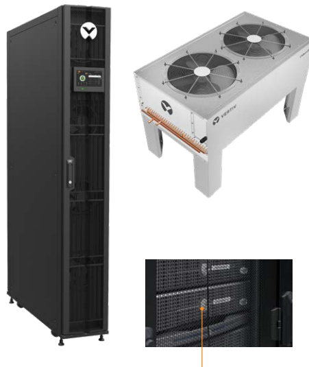
Rack sensors ensure the correct amount of cold air is provided to eliminate hot spots