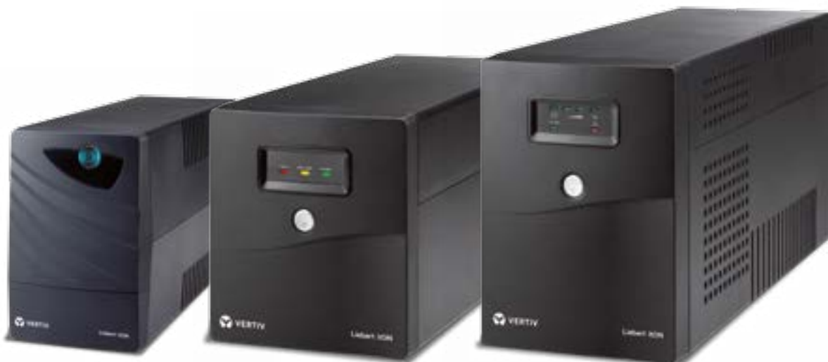
Liebert iTON 600 VA