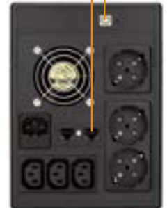
Liebert iTON 1500 VA Liebert iTON 2000 VA

Note: External battery cabinets are not permitted. Internal batteries only.