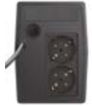
Liebert® iTON 400 VA Liebert iTON 600 VA Liebert iTON 800 VA